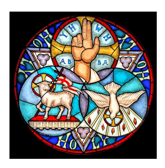
From the Pastor

T: 865-524-0308 Email: office@firstknoxville.org