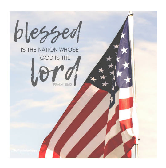
From the Pastor

T: 865-524-0308 Email: office@firstknoxville.org