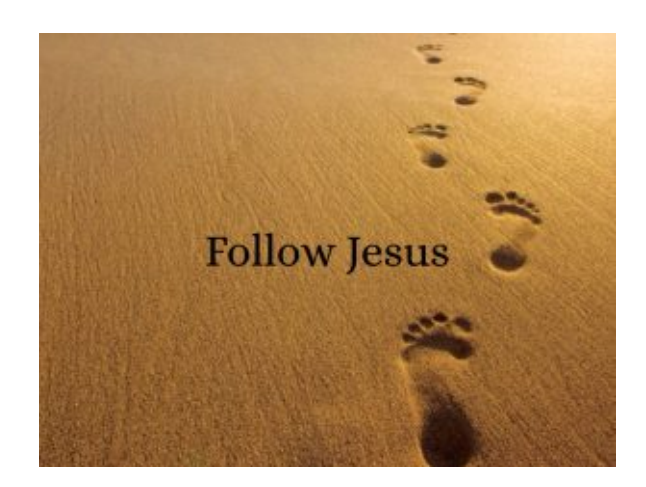
In Other News